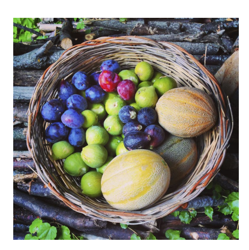
Bountiful. Blessed. Balance.

Mailing Address: N4695 CTY BB, Chilton Town Office: 920-849-4720